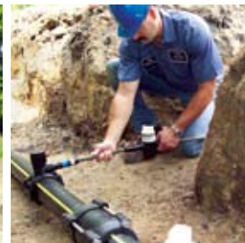
Permasert outlets make connecting to valves and tees fast and easy.