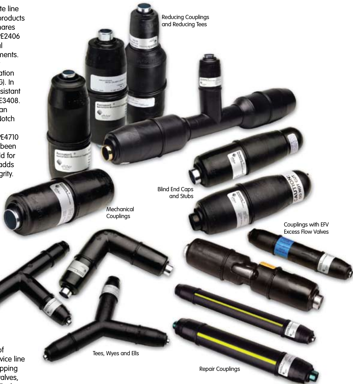
Reducing Couplings and Reducing Tees

Complementing the wide variety of couplings, we offer anodeless service line risers, PermaLock® Mechanical Tapping Tees, PSV™ polyethylene shut-off valves, and Perfection excess flow valve. Each of these products features Permasert coupling outlets and are available in a broad range of sizes.