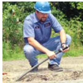
Installing a blind end cap allows for easy future connections.