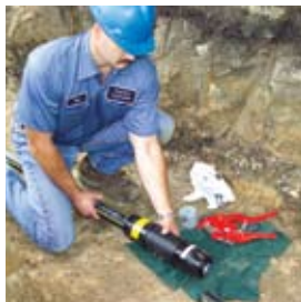
Permasert couplings simplify repairing damaged service lines.

An ever increasing number of utilities, and their contractors, are arriving at the same conclusion...Permasert mechanical couplings offer significant total installed cost savings compared to alternate connection methods. Why? It's simple. Permasert takes one person only a few minutes to install...without any expensive equipment or extensive training. All you do is cut the PE piping, chamfer the end, mark the proper stab depth and insert the PE piping into the coupling. That's it. No torque requirements and no special tools. Fast, safe and easy...saving you time and money.